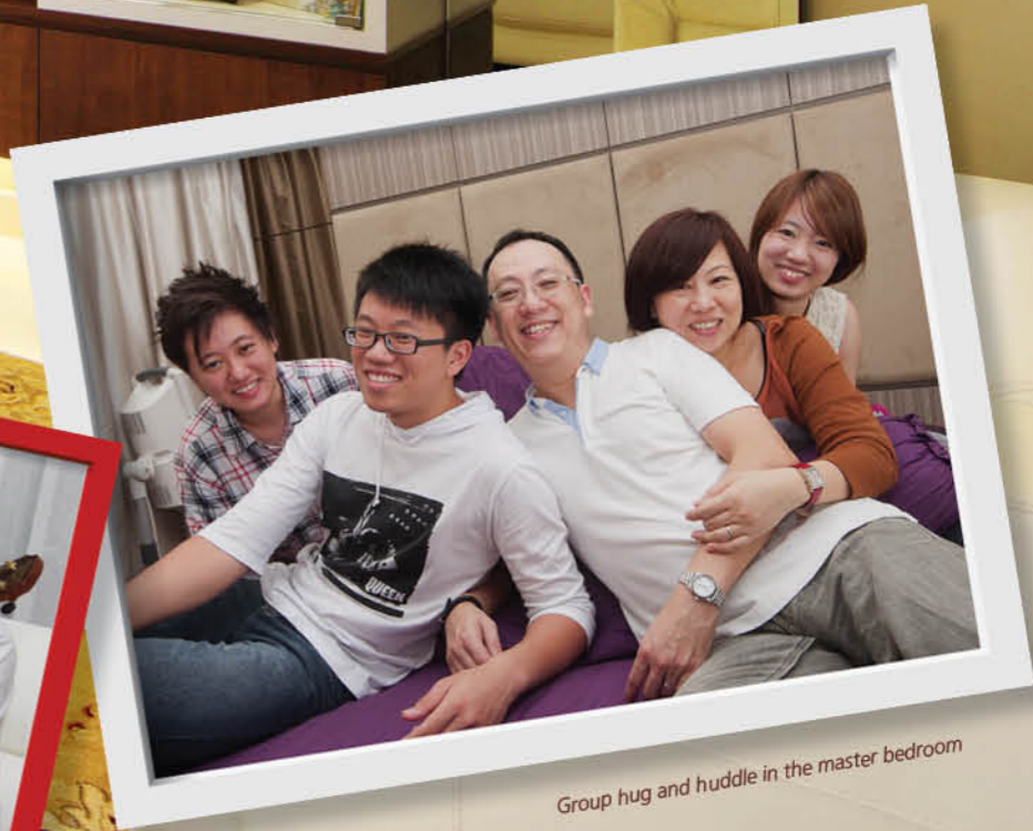
Group hug and huddle in the master bedroom