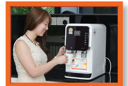
One of the household's four AOX water dispensers