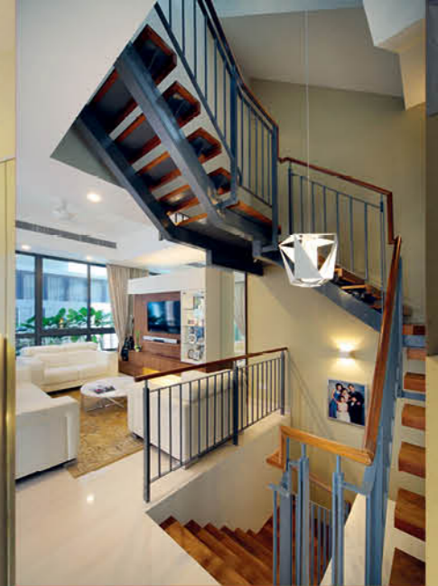
A common staircase connects all four levels

Roomshot images courtesy of 2nd Phase Design.