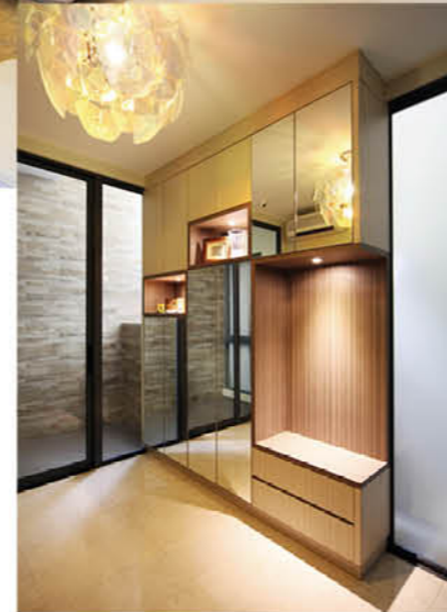
Abundant concealed storage space fulfils the brief to the ID firm

for many happy family barbecues and steamboats, and a koi pond.