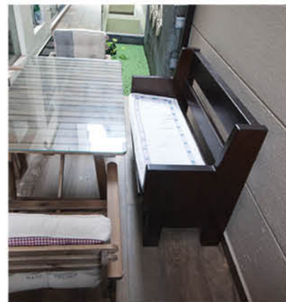
The only item from the Tans' former home: a salvaged church pew

An original but redundant feature of the first level of the house, a four-person jacuzzi that looked out onto the garden, was removed and replaced with rustic wood lookalike flooring. It now houses a timber outdoor table setting, the venue